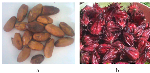
Figure 1. Roselle calyces

Producing the Zobo/date drink. The roselle calyces were sorted, washed, and weighed (300 g). They were boiled in 4 L of water for 10 min, allowed to cool, and filtered using a sterile muslin cloth. The dried dates were deseeded, weighed (850 g), and soaked in water (1800 mL) for 8 h. The slurry was then wet-milled, mixed with extra water (1200 mL), boiled for a few seconds, and filtered through muslin cloth. The date juice was obtained from the filtrate. The Zobo drink and the date fruit juice were blended in different ratios of 90:10, 80:20, 70:30, 60:40, and 50:50 and labeled as samples