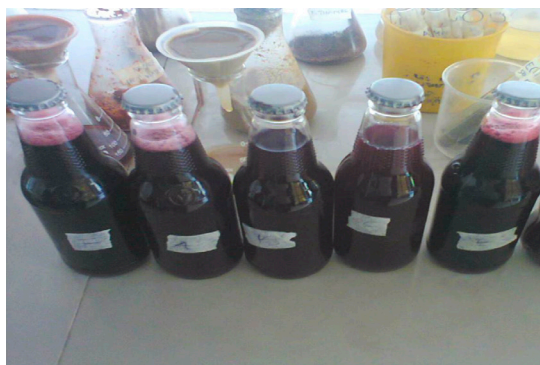
Figure 2. Zobo/date drink samples